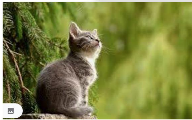
30,000+ Free Cats & Animal Images - Pixabay pixabay.com