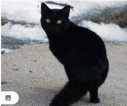
The Blackest of Cats | There are so ...