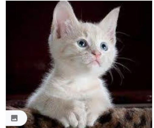
30,000+ Free Cats & Animal Image... pixabay.com