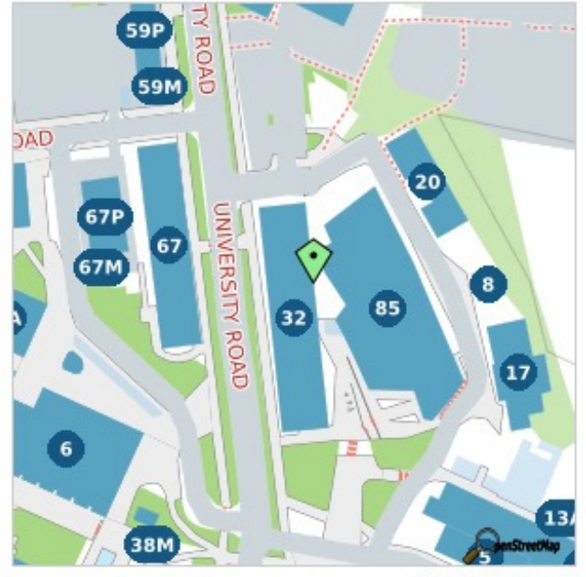
View Larger Map